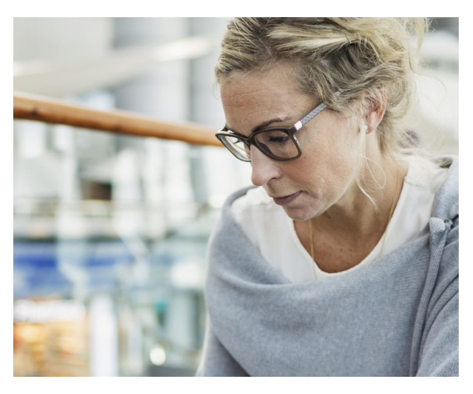
©2020 Chubb Insurance Australia Limited. Chubb®, its logos, and Chubb. Insured. ^{\rm SM} are protected trademarks of Chubb.